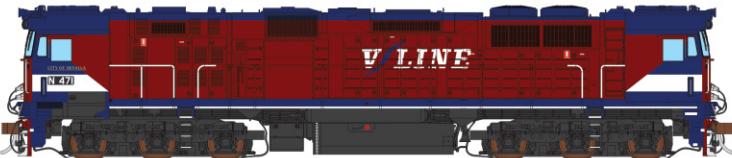
N-19 N471 V/Line Pass MK2 - Red/Blue/White (City of Benalla)