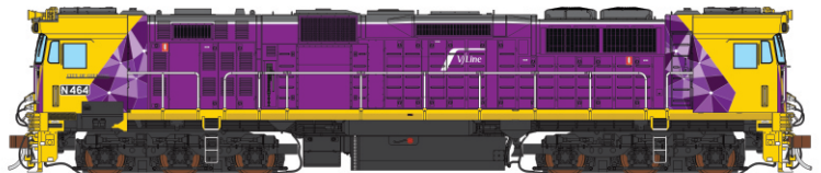
N-28 N464 V/Line PTV - Purple/Yellow (City of Geelong)

*Model details, delivery dates & prices subject to change without notice.