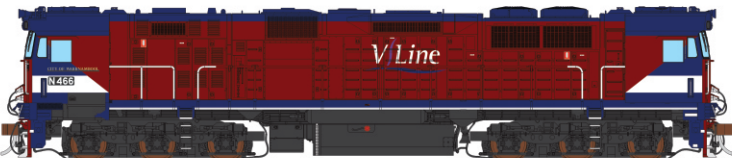
N-21 N466 V/Line Pass MK2 - Red/Blue/White (City of Warrambool)