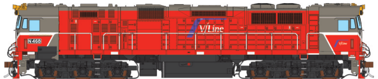
N-22 N468 V/Line Pass MK3 - Red/Yellow/Grey Trial Livery (City of Bairnsdale)