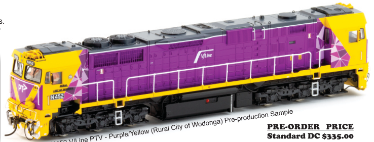
N-26 N452 V/Line PTV - Purple/Yellow (Rural City of Wodonga) Pre-production Sample

PRE-ORDER PRICE Standard DC $335.00 DCC Sound $465.00