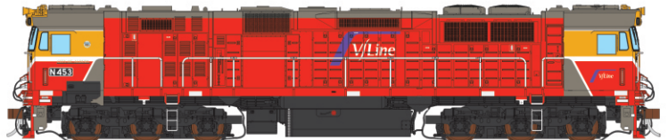
N-23 N453 V/Line Pass MK3 - Red/Yellow/Grey (City of Albury)