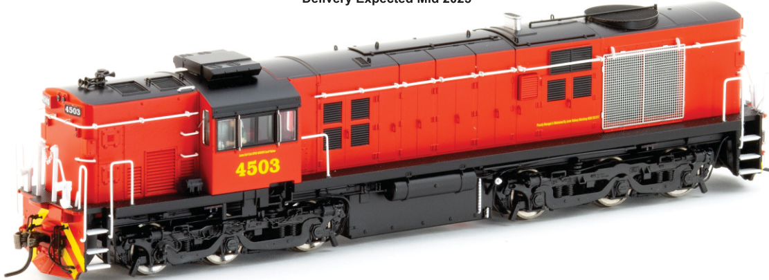
45-44 4503 Patrick - Red/Black

Ready-to-Run In HO Scale Delivery Expected Mid 2025*